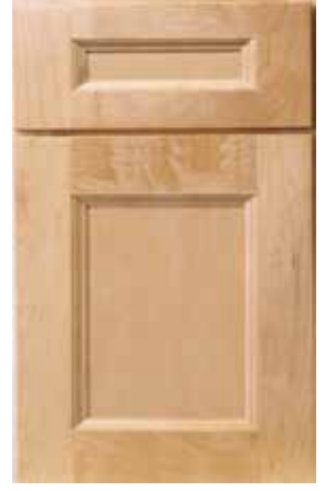
Wide Style Full Overlay